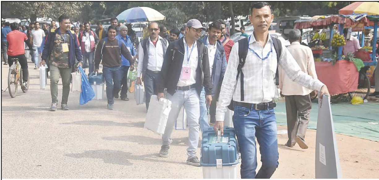
RANCHI, Election Officials carrying Electronic Voting Machine (EVM) and Voter Verifiable Paper Audit Trail (VVPAT) depart for polling station on the eve of first phase of Jharkhand Assembly Elections at Morhabadi Grounds in Ranchi, Jharkhand on Tuesday.