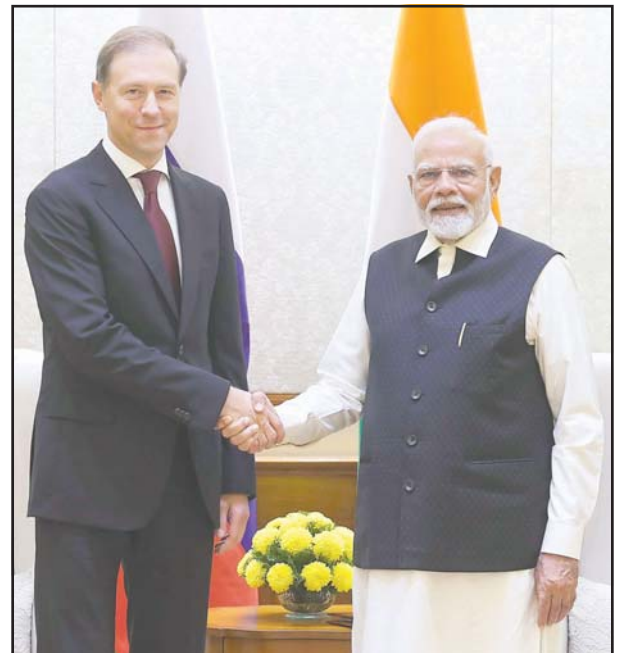
NEW DELHI, PM Narendra Modi meets Russia's first Deputy Prime Minister Denis Manturov, in New Delhi on Monday.

The World Intellectual Property Organisation (WIPO) was established in 1967 as a United Nations' agency. Based in Geneva in Switzerland, the organisation's main function is to promote the protection of Intellectual Property rights worldwide.