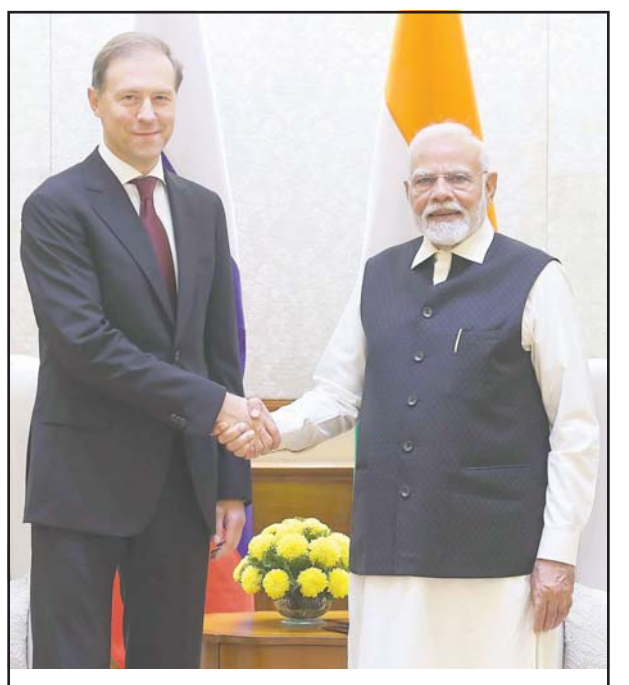
NEW DELHI, PM Narendra Modi meets Russia's first Deputy Prime Minister Denis Man-turov, in New Delhi on Moday.